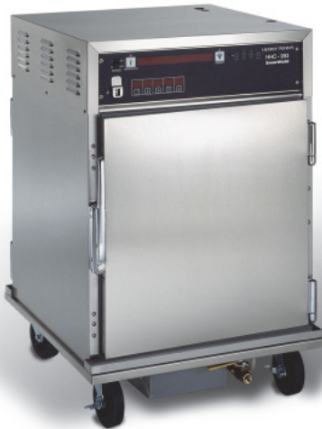
HHC-993 SmartHold holding cabinet with recessed water pan, 5-inch (127 mm) casters. Holds 5 full-size sheet pans.