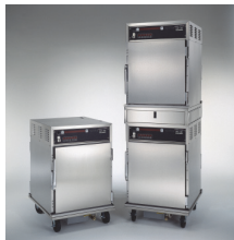
Stacked version HHC-992 from two HHC-993s. Stacked unit is completely assembled at the factory.